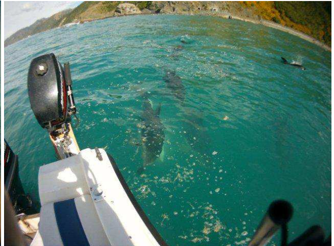
Dolphins hanging around the boat