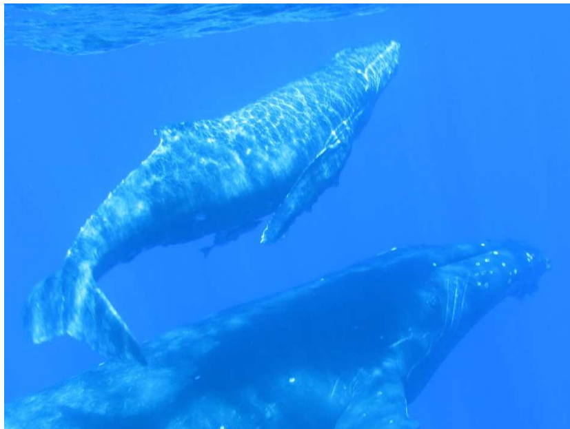
Humpback whale and calf, Vava'u