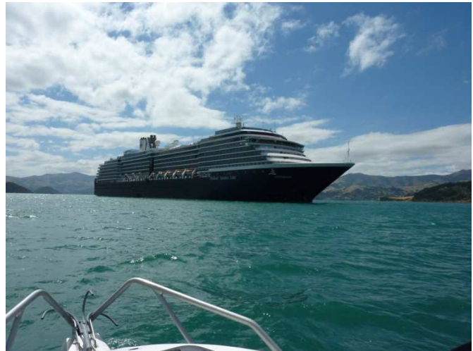
Luxury cruise ship at anchor in Akaroa harbour