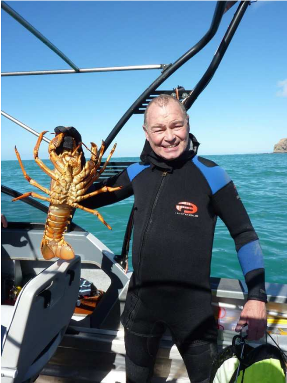
An omen of good diving to come on this boat!