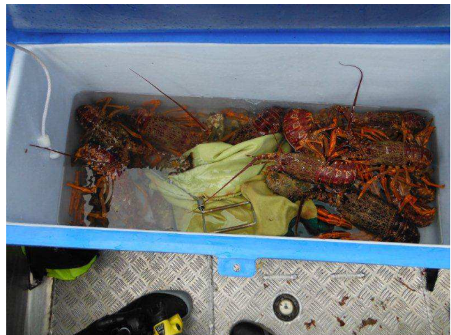
A nice ice bin of crays