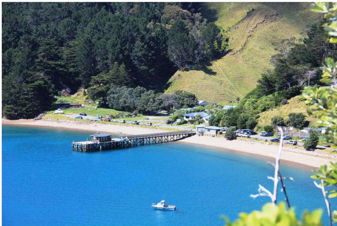
View of French Pass settlement by Bert Parker

A somewhat smaller group than originally booked due to some last minute cancellations which was disappointing. Still we were a happy bunch and enjoyed some fantastic scallop dives, most divers returning with big fat scallops and easily reaching their quota. It seemed that the fishing was a little less successful with no kingfish making into a boat however some got their blue cod quota as well a as few other species.